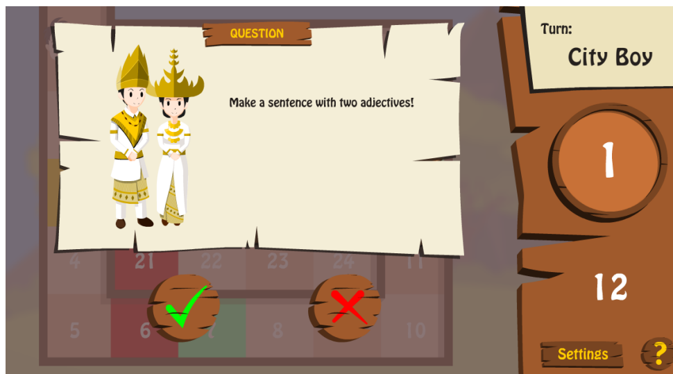
Figure 3. The example of the instruction after the students move their pawn

UMM, especially electrical engineering major is chosen by the researchers because both of the researchers were the alumni of this university and one of them is the ESP lecturers in this institution until now. So, the researchers had access to do a research in UMM. Moreover, the preliminary survey and book observation were conducted by the researcher by collecting the data from book analysis, giving questionnaire to students. Regarding the instruments, the researcher used questionnaire. Based on the preliminary survey in the form of questionnaire and book observation done by the researcher on December 19, 2015, there are some reasons why the researcher proposes a multimedia-based medium as an alternative medium for teaching ESP in UMM. First, the speaking activities in the book used by the ESP lecturer entitled English for Electrical Engineering (2014) are monotonous. The activities are mostly individual performance, group presentation, role-play, and making a dialogue. Second, ESP program in UMM is a model for other schools or universities that want to create the same program. It is proven by some universities or school who visited Language Center (LC) UMM to have ESP study visit because some of them do not have an ESP program yet and some of them want to know about the syllabus, teaching and learning process, media used, and many more. The list of school and university are provided in the table below: