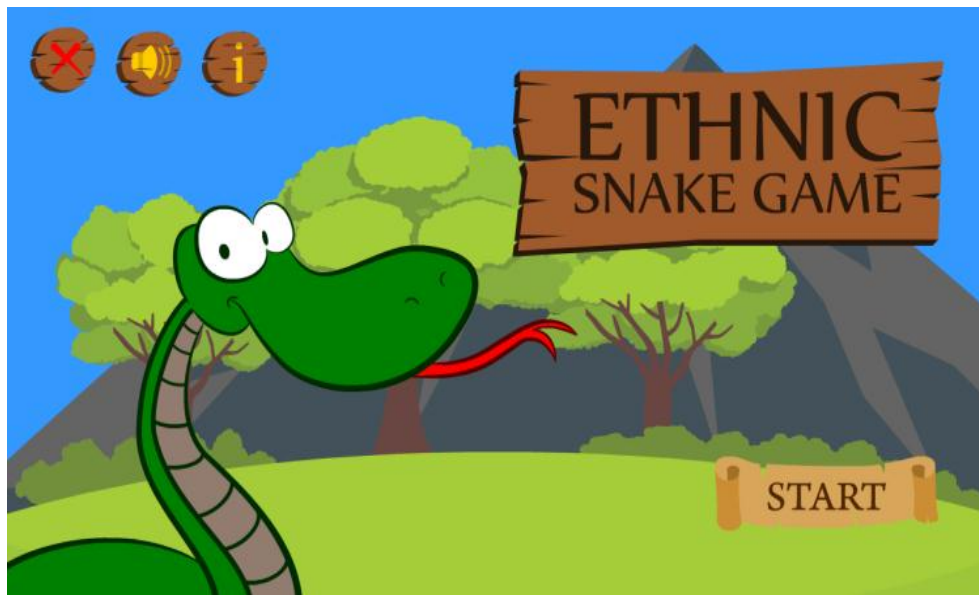
Figure 1. The first appearance of the multimedia game

based on the instruction given below the picture within 15 seconds. If their answer is correct, the lecturer will click on check button (✓) and they can stay on the position and roll the dice again after others group play. However, if their answer is wrong, the pawn will automatically go back two steps. How to play this game is almost the same like snake and ladder game that are some pawn, dice, and board. The students' pawn will move based on the number after rolling the dice. If they are lucky, they get number on the board with a question and they need to speak based on the instruction shown within limited time. However, if they cannot speak clearly according to the lecturer, their pawn will go back two steps. The worst is unlucky number which they will get number on the board with skip turn caption, go back two steps, etc. Finally, the winner is the fastest student or group to reach finish line.